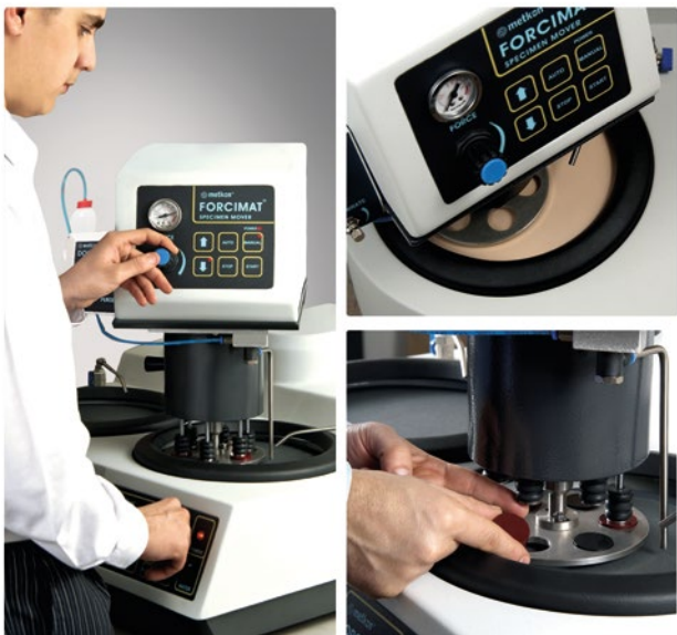
By using the FORCIMAT automatic head, the efficiency increases and same consistent sample quality is guaranteed.

An adjustable and exchangeable drip lubricator is optional and the dosing level is done through and adjustable flow valve. The Forcimat Automatic Head offers variable speed with reversible (clockwise or counter-clockwise) rotation. A choice of easily exchangeable sample holders with set of rings from 25 to 50 mm and 1" to 2" diameter are available for use on the FORCIMAT. The samples (1 to 6) are placed in the sample holder and the dosing level of the drip lubricator is adjusted. Sample force is set on the front panel of the FORCIMAT. Cycle time, wheel speed and direction are set on the control panel of the FORCIPOL grinder/polisher. When the start button is depressed, both the FORCIMAT and FORCIPOL start operating simultaneously. Upon completion of the cycle, both instrument stop and an audio signal notifies the operator.