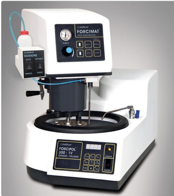
FORCIPOL 1V, Variable speed grinder / polisher with FORCIMAT Automatic Head.

Forcipol 1V For laboratories preparing a wide range of different materials, Forcipol 1V is the ideal grinder/polisher with its indefinitely variable speed range between 50-600 rpm.