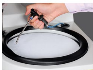
Retractable water hose for easy cleaning

When the number of specimens to be prepared increases, FORCIPOL instruments can be fitted with FORCIMAT automatic head for automation. FORCIMAT automatic head provides high rate sample preparation and frees the operator from the grinding and polishing procedures.