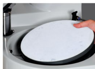
Simple exchange of working discs