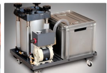
Enviro recirculating filtering unit (1 micron)