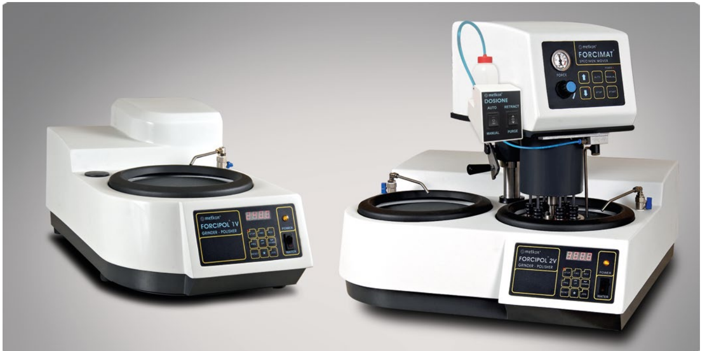
FORCIPOL 1V ( above left ), FORCIPOL 2V with FORCIMAT ( above right ).

FORCIMAT is a microprocessor controlled sample mover designed to be used with FORCIPOL grinder / polishers. It is ideal for medium size labs where consistent result are desired.