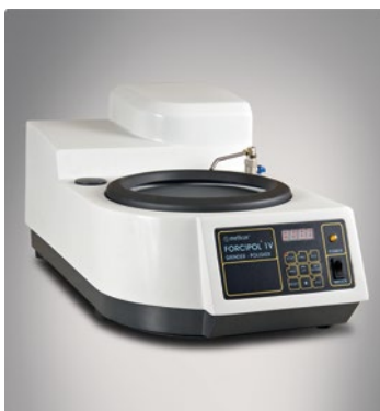
FORCIPOL 1V variable speed grinder / polisher

All materials testing laboratories in the industrial, research or educational field have a demand for sample preparation. Whether your requirements call for individual components or basic sample preparation, FORCIPOL family of instruments will meet your needs. FORCIPOL Series of instruments are available as Single wheel and Dual wheel Units (200/250/300 mm wheel size). Both single or double wheel versions are available with variable rotating speeds with digital display. This allows the setting of the optimum speed for each individual preparation process. The modern electronics provide a smooth speed variation.