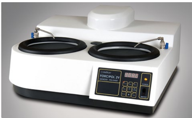
FORCIPOL 2V, Variable speed unit with two discs.

Forcipol 2V Having two discs and variable speed range between 50 and 600 rpm, Forcipol 2V is the most universal grinder/polisher, especially for labs having wide variety of materials. When coupled with Forcimat, Forcipol 2V becomes a versatile automatic sample preparation system with high operator comfort.