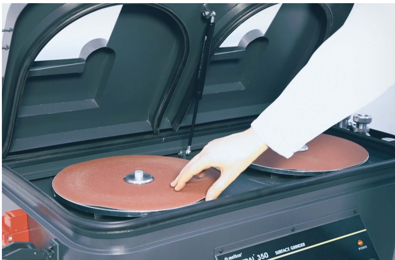
Vacuum Suction of Grinding Paper

Sample preparation of metals and materials have become more and more important because of the rapid development and improvement of both software as well as OES and XRF-devices during the past few years that shifts the detection limit for trace analyses. It is crucial to have the sample properly prepared. The sample needs to be both representative, homogeneous and with an even surface in order to eliminate factors that can influence the results. For the preparation of solid metal samples METKON offers manual and automatic sample preparation machines - from the small table-top disc surface grinder to automatic milling machine. With METKON Sample Preparation Machines, you feel yourself ready for the analysis.