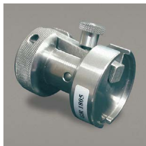
Mechanical Type Sample Holder