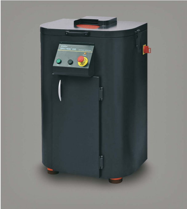
SPECTRAL 350-1 Single Disc Grinder

SPECTRAL 350 is used to achieve excellent precision flat surfaces of iron and steel samples for spectroscopic analysis. The robust and vibration-free construction has been designed for continuous operation at high sample throughput.