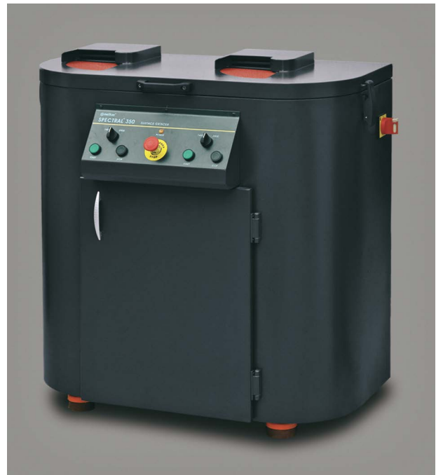
SPECTRAL 350-2S Double Disc Dual Speed Surface Grinder