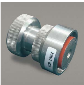
Magnetic Type Sample Holder

Magnetic and mechanical specimen holders for samples up to 50 mm. dia. available ensure maximum operator safety.